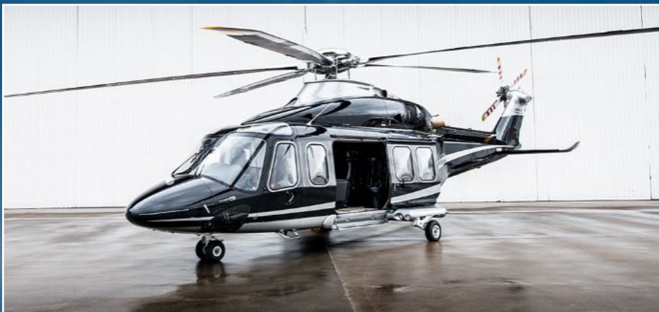
Agusta 109 Power