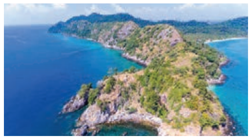
4. Koh Ngai An island of evergreen forests, coconut palms, sandy beaches and snorkeling spots.