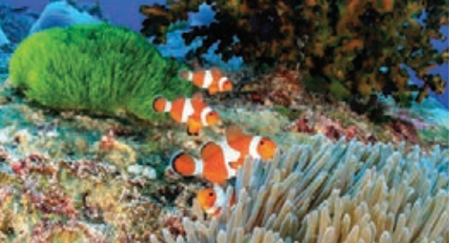
2. Similan Islands Some of the world's best diving spots with hard and soft coral around 11 islands.