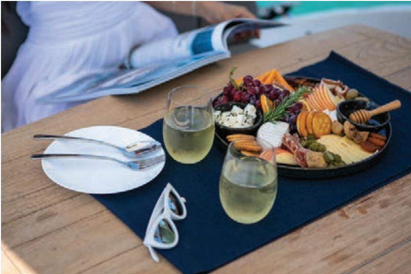
On board services