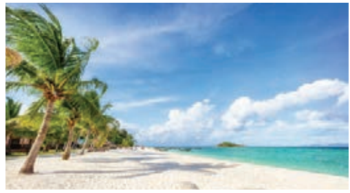
9. Koh Lipe An L-shaped island surrounded by clear waters and coral for diving and snorkeling.