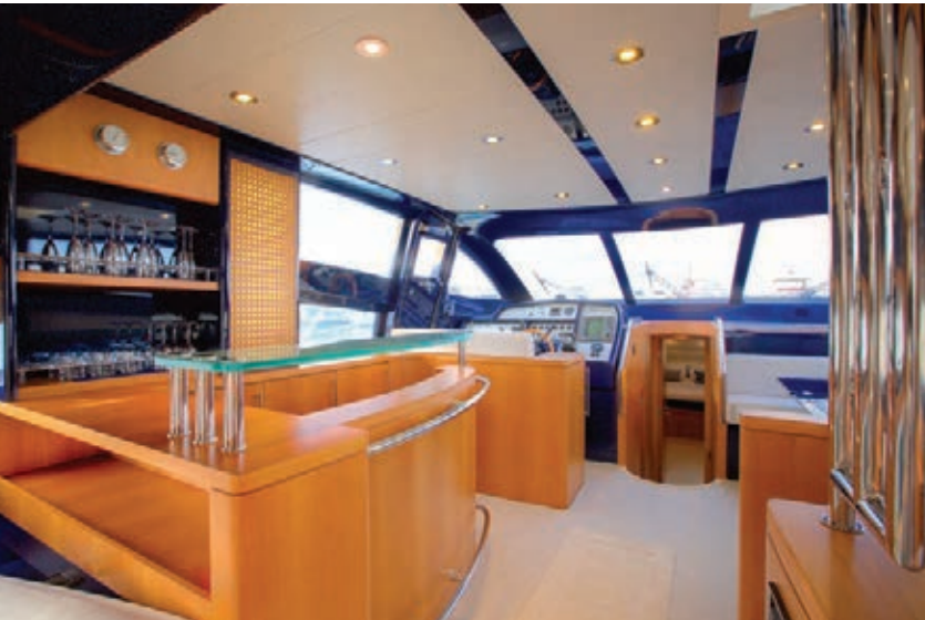
Cockpit and galley