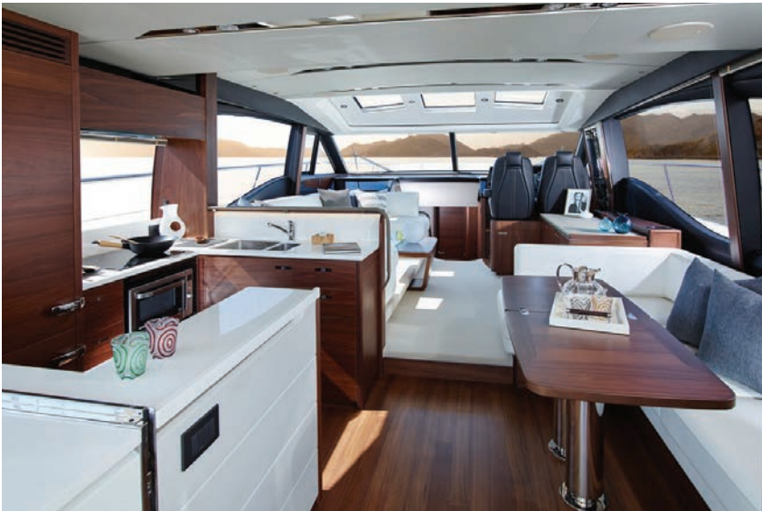
Cockpit and galley