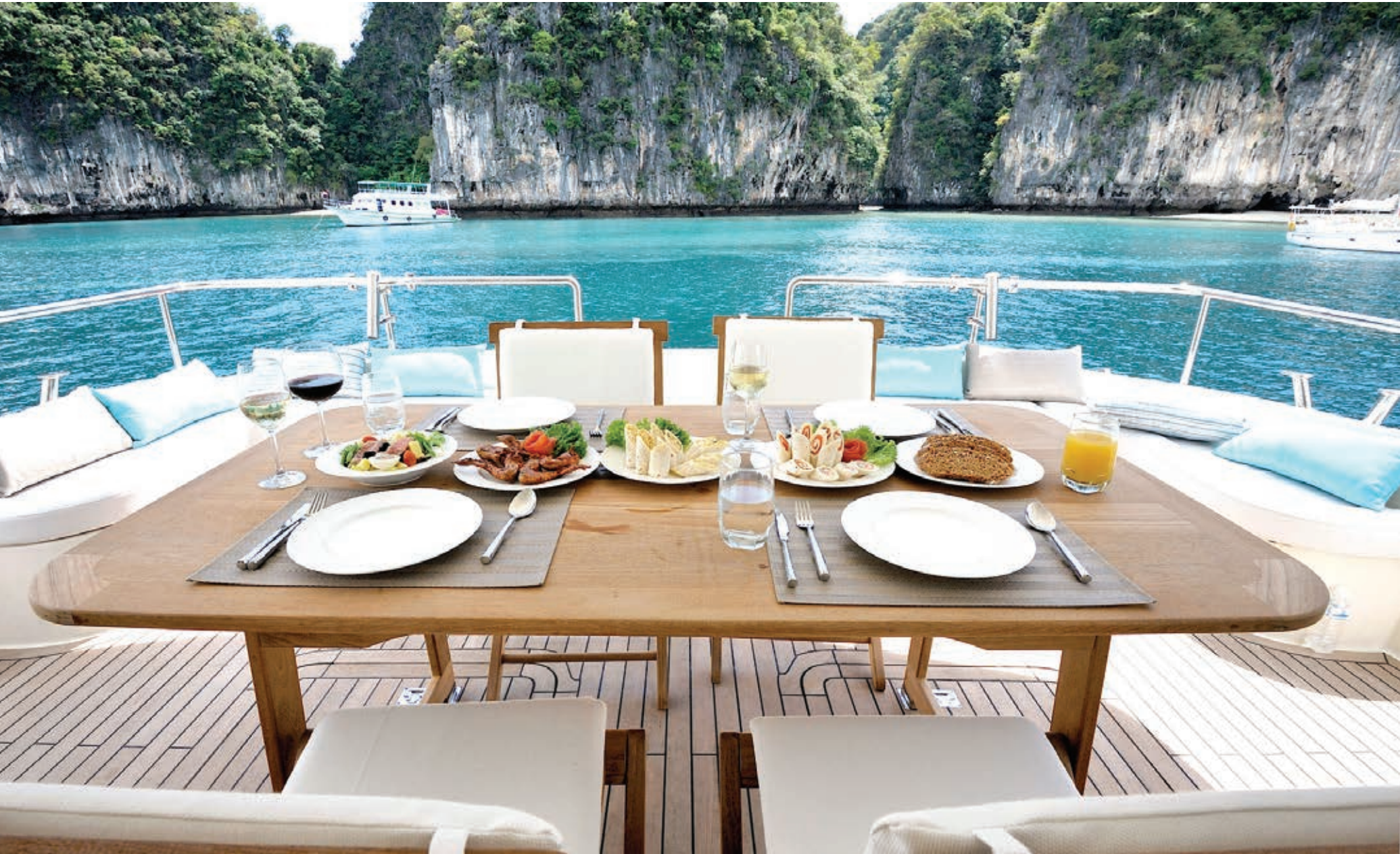
Open-air dining deck