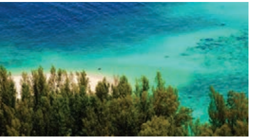
8. Koh Adang Several dive spots with an abundance of coral and fish near the Malaysian border.