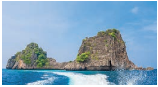
7. Koh Rok A quiet island for snorkeling, diving or walking on the white sand beach.