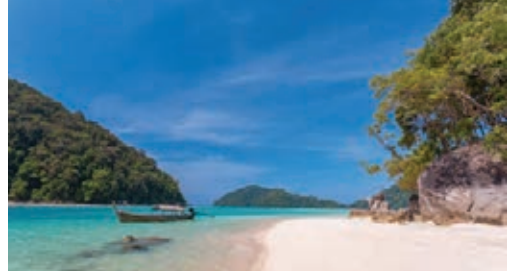
1. Surin Islands Five islands with coral gardens and a sea gypsy village, ideal for diving and snorkeling.