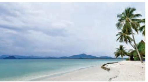
5. Koh Muk Tall cliffs with swallow's nests, a village and Emerald Cave, accessible only by boat.