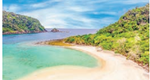
3. Koh Haa (Five Islands) A popular dive spot with underwater caverns, lagoons and vibrant marine life.